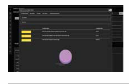
Knowledge base look up for all connected equipment.